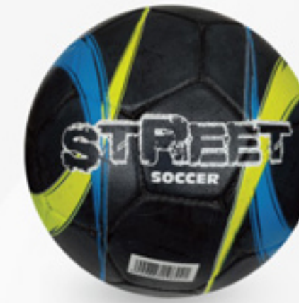
BLUE - YELLOW AVFLM0013