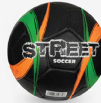
ORANGE - GREEN AVFLM0012