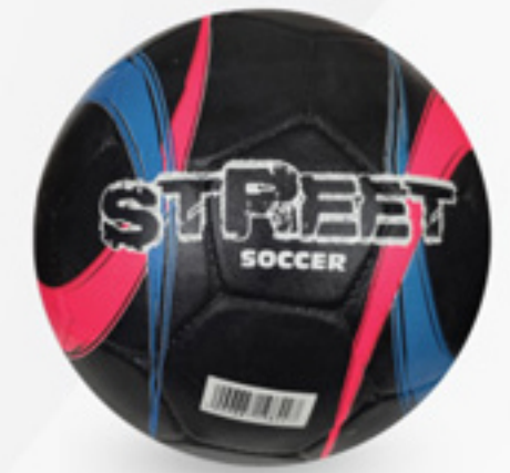
RED - BLUE AVFLM0014